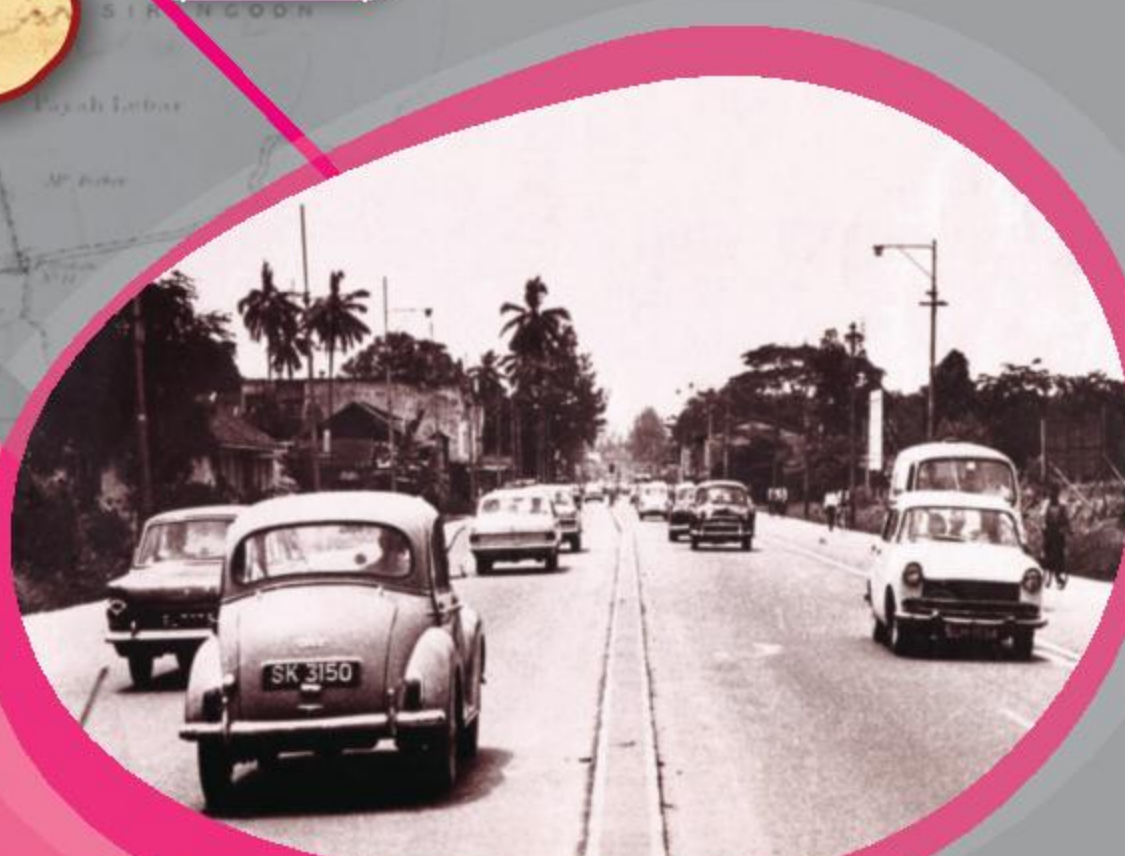
◀ Upper Serangoon Road in the past 过去的实龙岗路上段